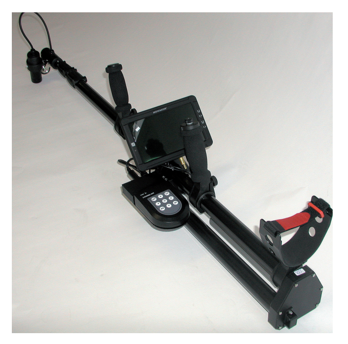
EFIS® V with optional recording device