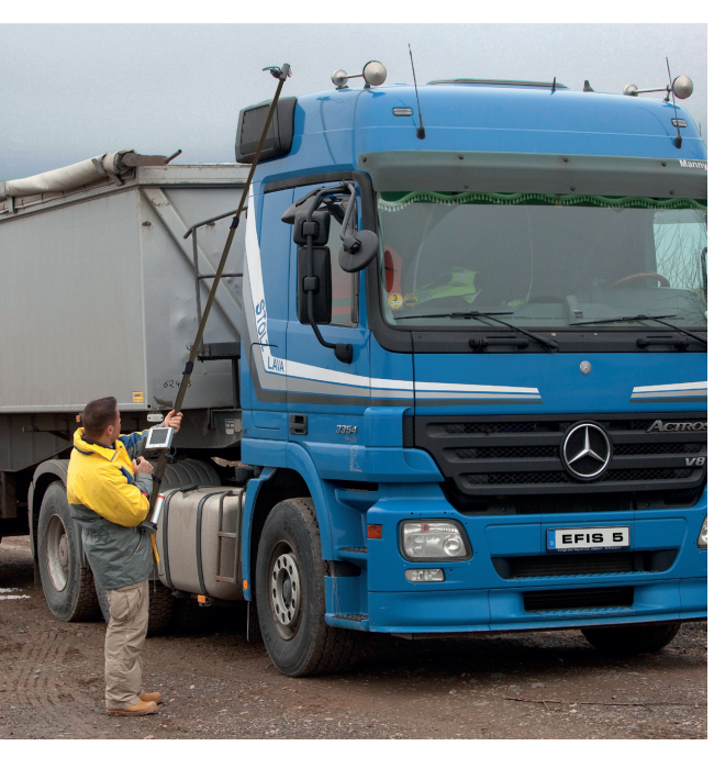
EFIS® V video control unit

The \mathsf{EFIS}^{\circledcirc}\ \mathsf{V} is also available with video recording function on SD-Card.