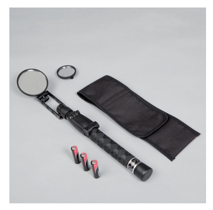
EFIS® S inspection mirror, small