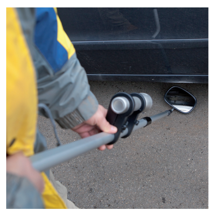
EFIS® 1 inspection mirror with torch

Upon request the following special versions can be supplied: square inspection mirror 150 x 250 mm or 220 x 310 mm, halo shaped inspection mirrors of Ø 300 mm (measures without protective frame), mirrors made from polished stainless steel.