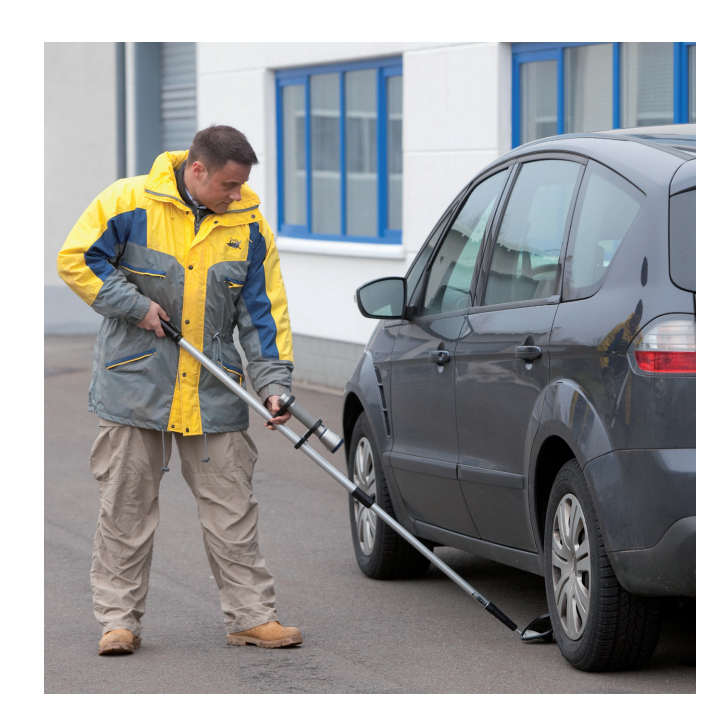
EFIS® 1 inspection mirror with torch

The pivoting mirror is slightly convex to enlarge the view. Different sizes of mirror heads can be supplied upon demand. Mirror heads of a diameter of Ø 300 mm and more are fitted with wheels.