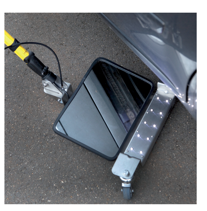
Illuminated EFIS® 4 under vehicle mirror