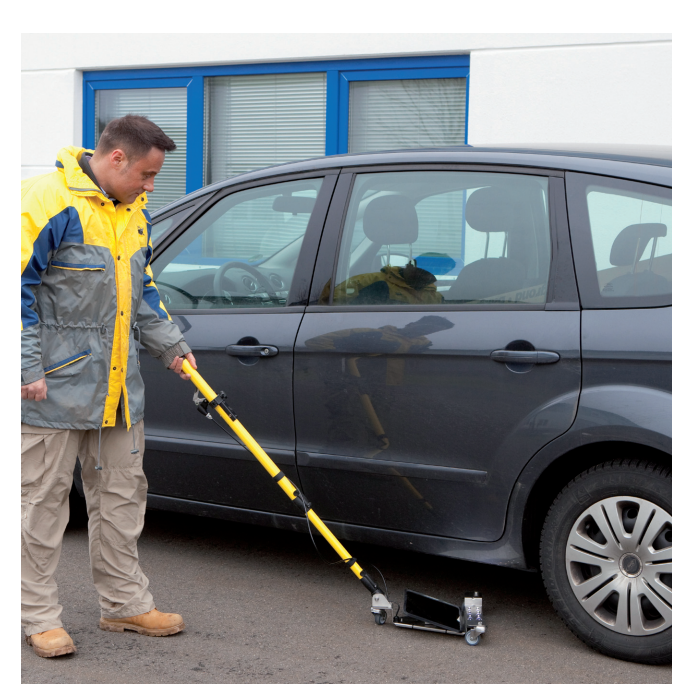
EFIS® 4 with mechanically adjustable mirror head

Optionally it can be delivered with remote mechanical adjustment of the mirror angle. Upon request it can be delivered as a very robust special version of polished stainless steel. A 200 x 400 mm sized mirror head is available as option.