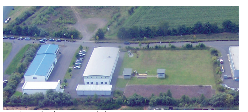
EBINGER technology center Wiesbaum