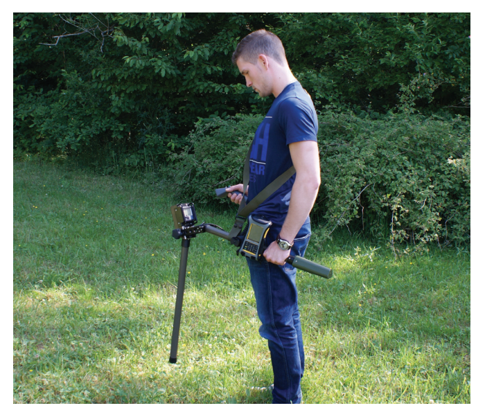
EPAD® data logger with EPAS® -Software

The EPAD<sup>®</sup> data logger and the EPAS<sup>®</sup> software are perfectly matched to one another and form the first class EBINGER system for recording, processing, visualizing and evaluating digital data for explosive ordnance disposal work. The EBINGER system is characterized in particular by the simplicity of use as well as by its multilingualism.